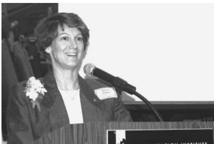
Eileen Collins speaks at dinner

Collins, now 49, is married with two children. She retired from the Air Force early in 2005.