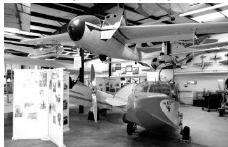
Exhibits inside display hangar

More information visit: www.wingsofhistory.org