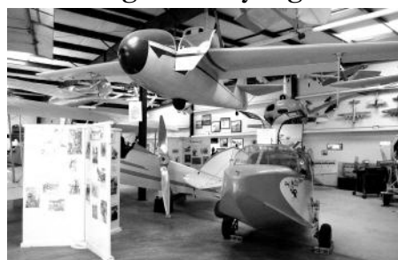
Exhibits inside display hangar

More information visit: www.wingsofhistory.org