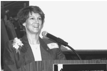
Eileen Collins speaks at dinner

Collins, now 49, is married with two children. She retired from the Air Force early in 2005.